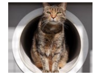
JUNE 2 YEARS OLD